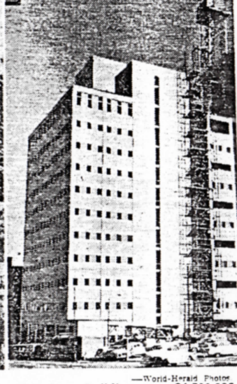
Telephone Building . . . $4,500,000.