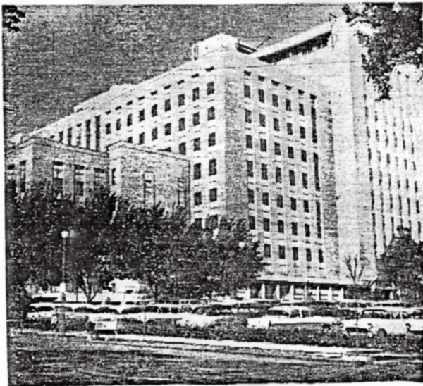
Mutual and United addition . . . 85 to 90 per cent completed.