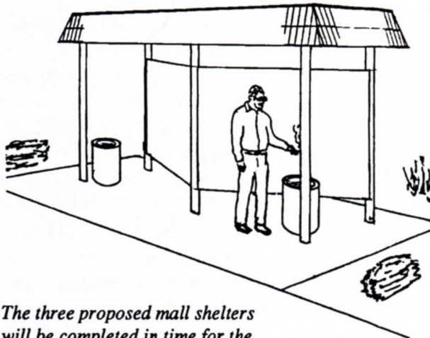
The three proposed mall shelters will be completed in time for the Sept. 3 transition to a smoke-free factory.