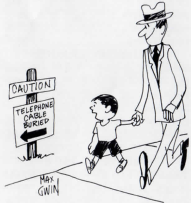
"Is that where they put the lines that have gone dead?"

All station-to-station calls can be dialed direct while person-to-person calls, collect calls, calls from public telephones and other calls requiring special handling must